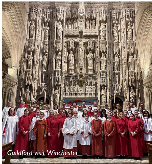
Guildford visit Winchester

We appreciate our choir enormously, so it is good to share their musicmaking with others. This academic year 2022-23 we joined up with the girls and Lay Clerks of Winchester Cathedral.