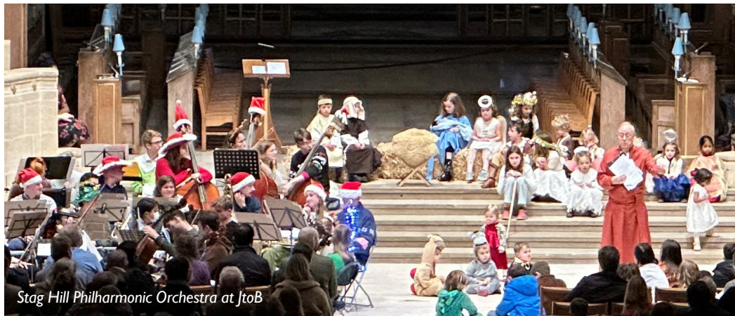
Stag Hill Philharmonic Orchestra at JtoB