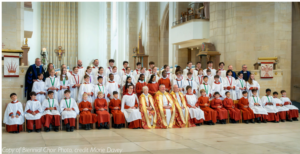
Copy of Biennial Choir Photo